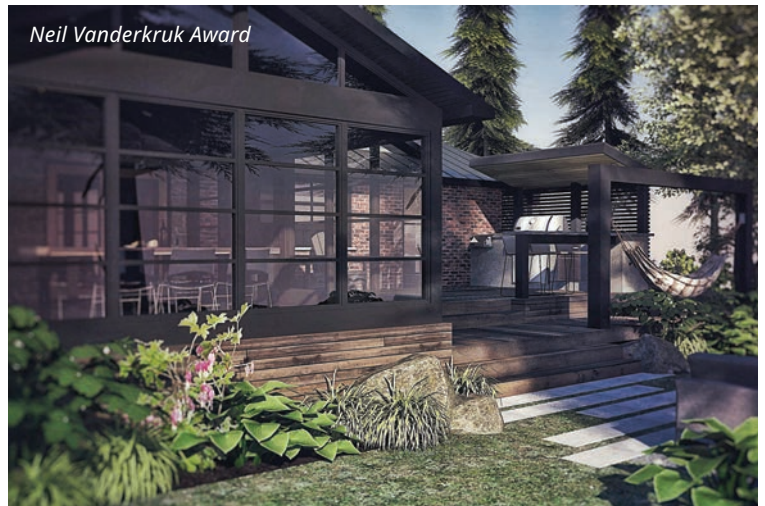
Neil Vanderkruk Award