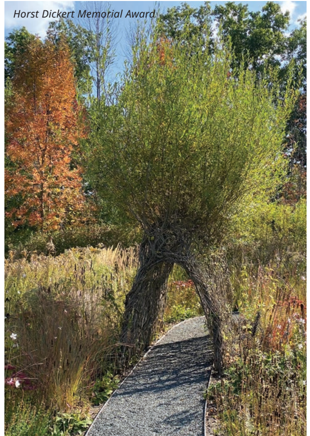
Horst Dickert Memorial Award