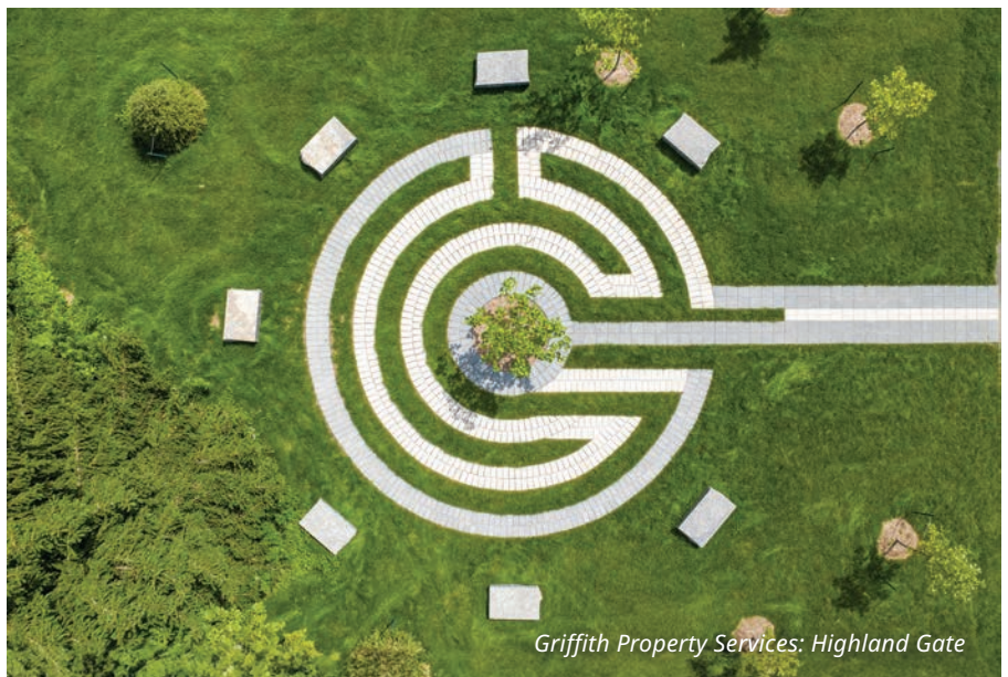
Griffith Property Services: Highland Gate