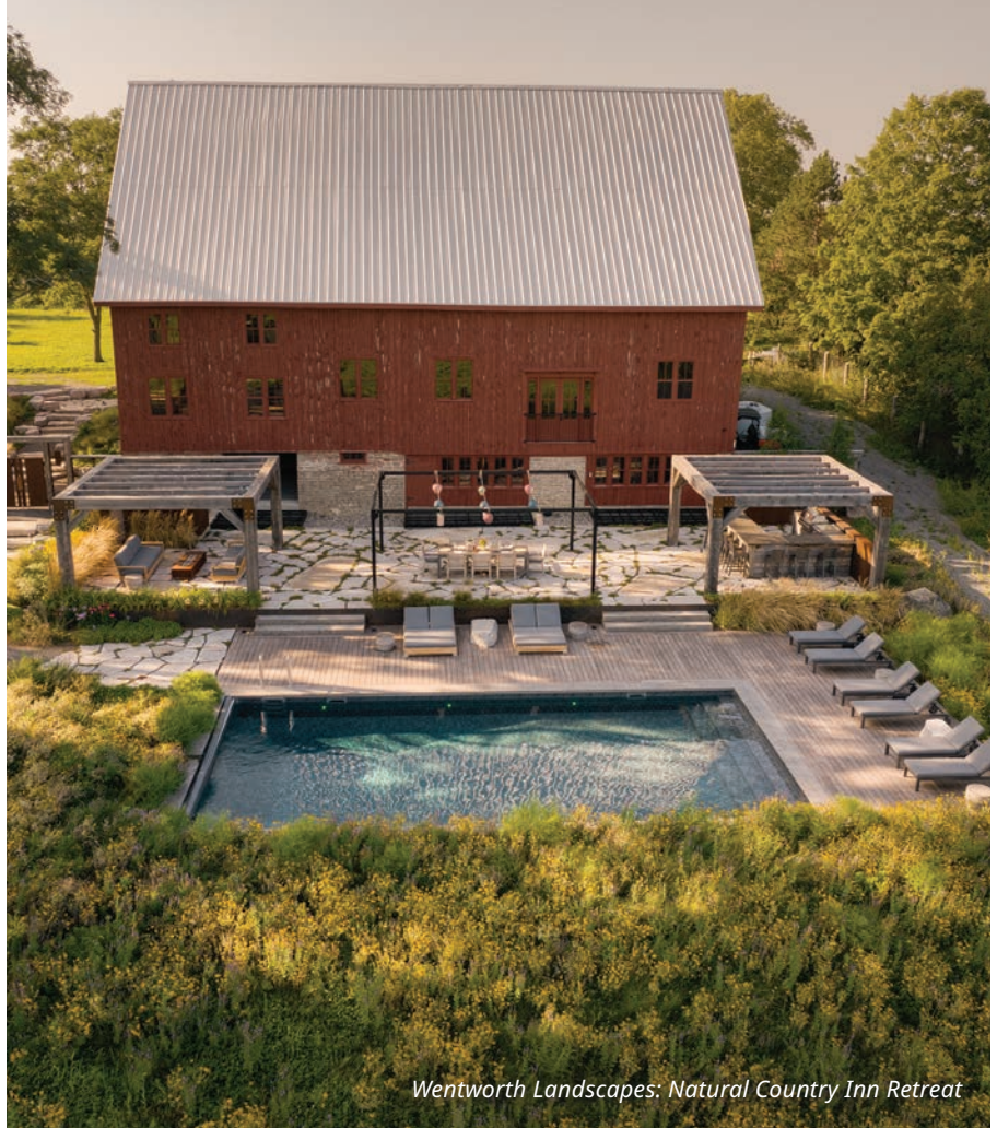
Wentworth Landscapes: Natural Country Inn Retreat

Residential Construction | $250,000-$500,000