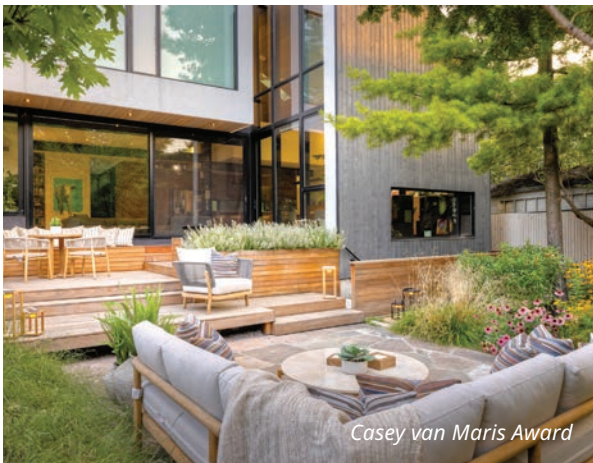
Casey van Maris Award