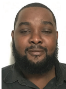
Chadwick Lewis Post-Secondary Scholarship, $1,000