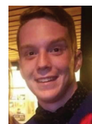
Avery Lacroix Cullen Scholarship Special Need, $4,000