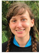
Megan Ljubotina College or University Scholarship, $1,000