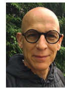
Joseph Merrett Post-Secondary Scholarship, $1,000