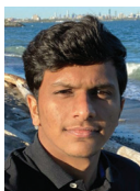
Nikhilkumar Patel Post-Secondary Scholarship, $1,000