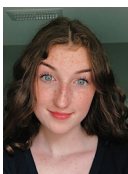
Hallie Phillips College or University Scholarship, $1,000