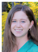
Mattison Innis Cullen Family Scholarship Program, $2,000