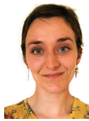
Olivia Hart Horticulturist Scholarship, $500