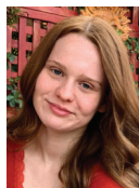
Thea Ridland College or University Scholarship, $1,000