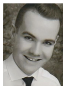
Trevor McBrayne College or University Scholarship, $1,000