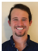
James Hughes Unilock Collaborative Scholarship, $1,000