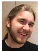
Sean Loose College or University Scholarship, $1,000