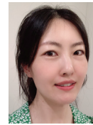
MiJin Kim Post-Secondary Scholarship, $1,000