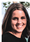
Georgia Schoonderwoerd College University Scholarship, $1,000