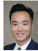
Kerwin Ki-Hin Yeung Post-Secondary Scholarship, $1,000