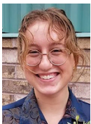
Laura Delorme Cullen Family Scholarship Apprenticeship, $2,000