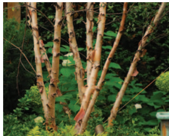
River birch is prized for its bark. Note the light fixture at the base of the tree; these homeowners enjoy its texture at night, as well. Oriole Landscaping Ltd