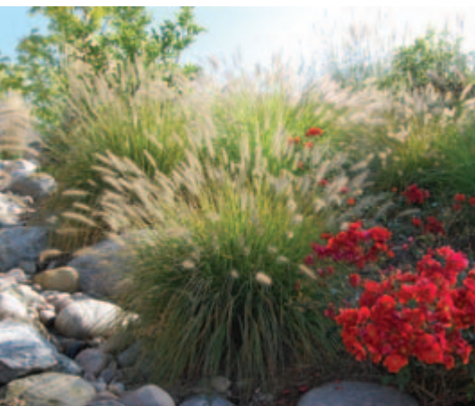
Feathery fountain grass defines spheres, as do the adjacent stones. Earthscape Ontario