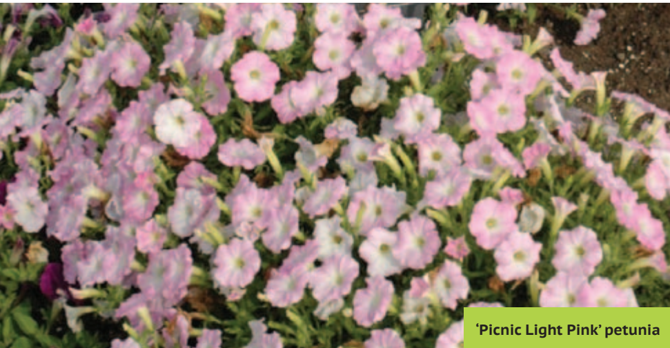
'Picnic Light Pink' petunia

Plant breeders worked overtime to develop some new black-flowered petunias, but how did they hold up in the unpredictable weather in Southern Ontario? Here's a look at some of the best performers trialed at the University of Guelph, Landscape Ontario in Milton and the Vineland Centre for Research and Innovation.