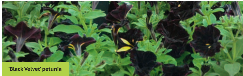
'Black Velvet' petunia