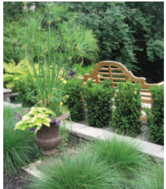
The centrepiece of this planter is a new papyrus cultivar. Though not technically a grass, but a sedge, its bold, sculptural shape carries on the tradition beautifully. KIVA Landscape Design Build