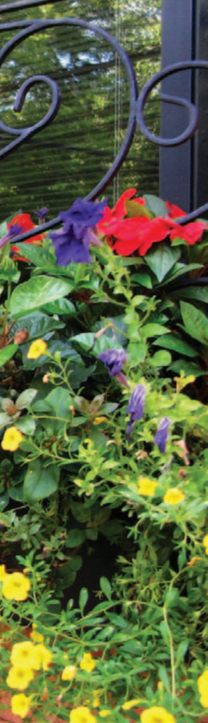
Bright red hibiscus, actually a woody tropical, adds extra punch to this windowbox. Aden Earthworks Inc