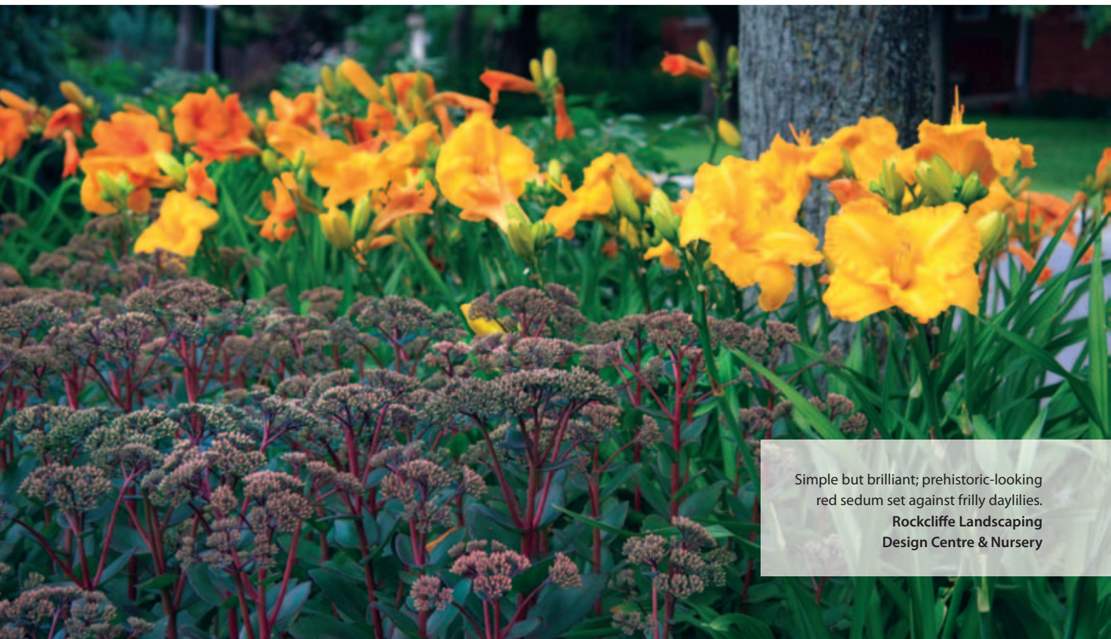
Simple but brilliant; prehistoric-looking red sedum set against frilly daylilies. Rockcliffe Landscaping Design Centre & Nursery

Why not think about feel and shape, before you consider colour? Even if you limit yourself to a few plants, you will never exhaust the design options.