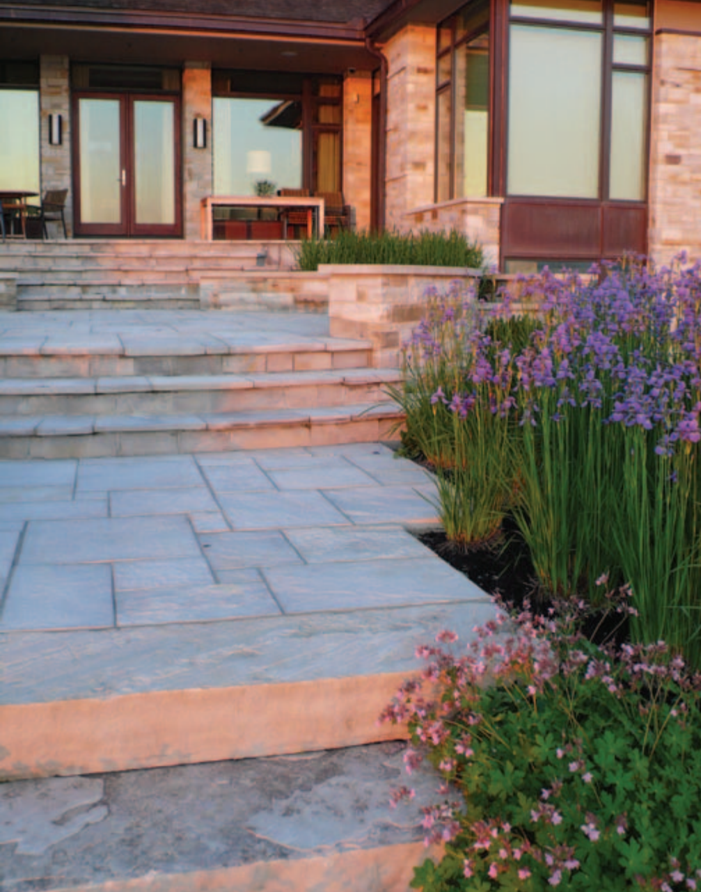
This handsome entrance features a strong architectural statement, and entrance steps of fine materials, workmanship and proportions. Siberian iris and perennial geranium provide the colour, softness and light to complete the welcome. R J Rogers Landscaping Ltd