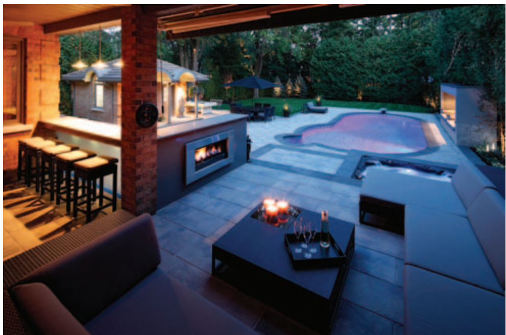
Today's landscape designers take a page from theatre lighting pros and use light to create many moods in the night garden. Griffith Property Services Ltd