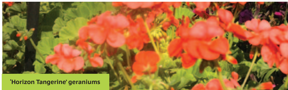
'Horizon Tangerine' geraniums