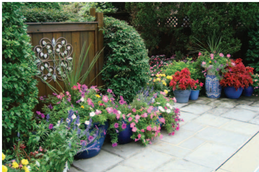
Blue is rare in flowers; this collection of cobalt-blue planters creates a jewel-like effect. Shades of Summer Landscaping & Maintenance