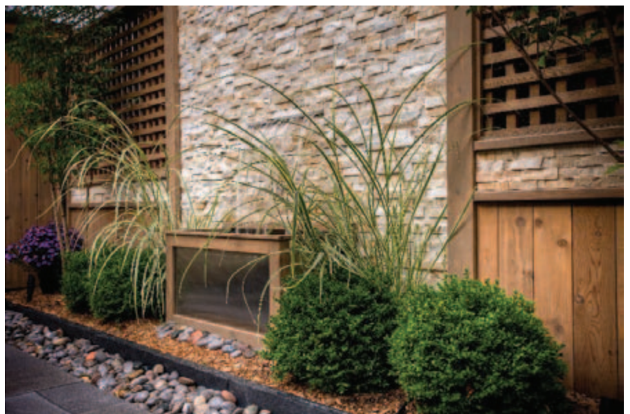
Dramatic centrepiece features sensitive hard structure: the stone panel with water weir, set off with lattice. Only expressive grass and boxwood are needed on each side to complete the composition. Land Effects Outdoor Living Spaces Ltd