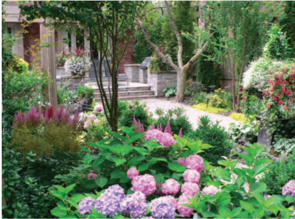
A beautifully-designed riot of colour and texture. The splash of red fuchsia in the urn stands out dramatically among the cool colours of this cottage-style garden. Kent Ford Design Group