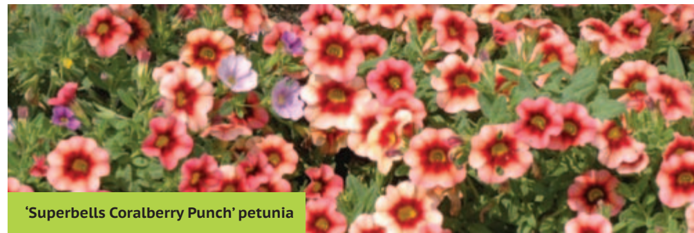
'Superbells Coralberry Punch' petunia