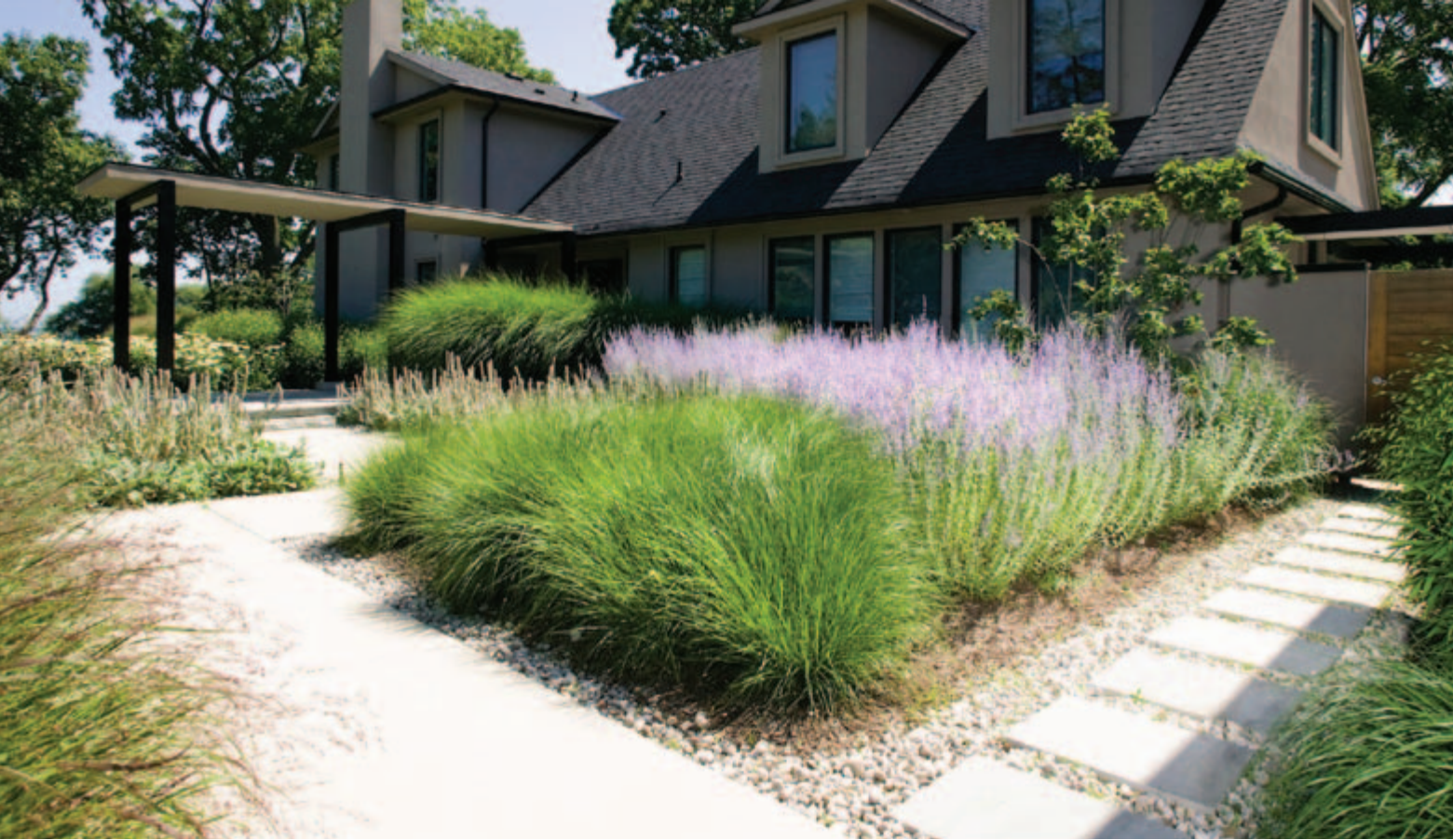
Sophisticated entrance features grass, but no turf. Fine-textured Pennisetum alopecuroides 'Hameln' is set off nicely by the taller, equally robust purple Russian sage. Eco Landscape Design