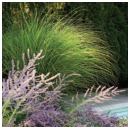
Perovskia , Russian sage, creates a robust texture in the landscape; enjoy its scent of sage. Eco Landscape Design