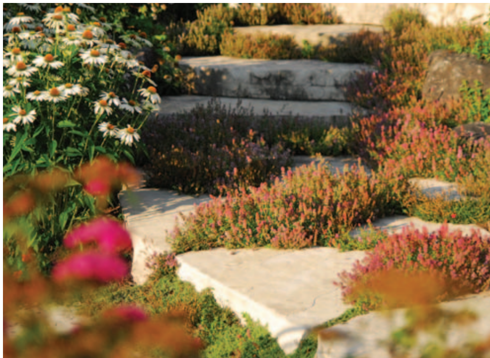
Light and shadow intensify colours and shapes; Mother-of-thyme on natural stone steps. The Landmark Group