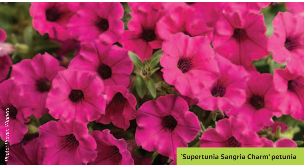
'Supertunia Sangria Charm' petunia