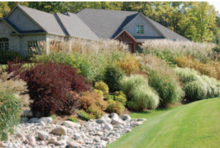
At least four grass cultivars contribute distinct sizes, colours and textures to create a rich and complex statement, using almost no flowers. Selections include Miscanthus sinensis 'Silberfeder' and 'Variegatus', Pennisetum alopecuroides and Calamagrostis brachytricha . Earthscape Ontario